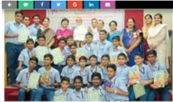
शिवाडी : बुद्धिमापन आणि प्रश्नयंत्रणा या आंतरशाखीय स्पर्धेमध्ये विजयी झालेले स्पर्धक.