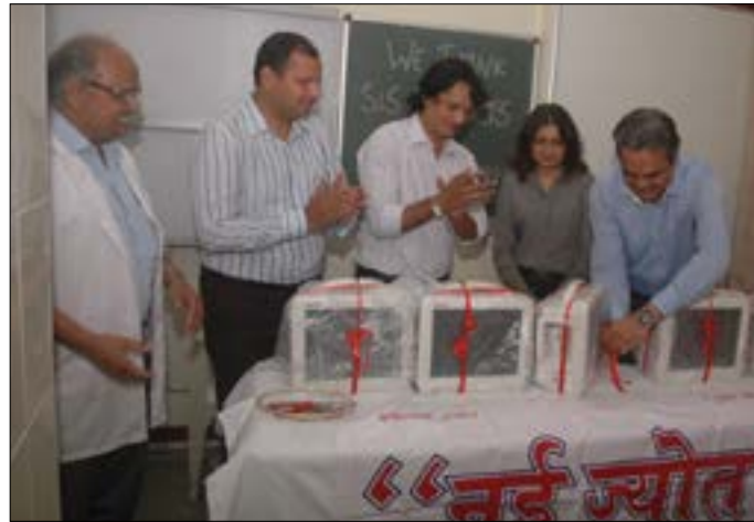
Donation of Multiparameter Monitors by SIS Imports (Paediatrics)