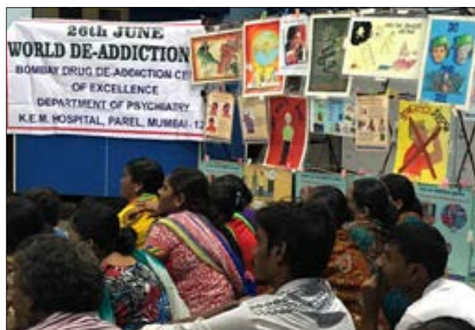
Celebration of World De-addiction Day (Psychiatry)