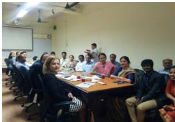
Inspection of the Pharmacovigilance centre by a WHO team [Clinical Pharmacology Department]