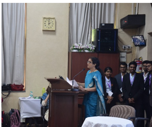
The photo of Unit members and students' WIng