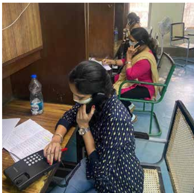
Psychosocial Support Cell Helpline Counsellors at work