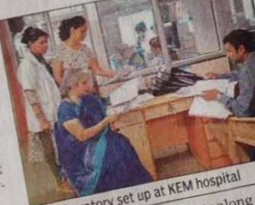
The laboratory set up at KEM hospital

Mumbai: The city got its second laboratory in a record two weeks as patients queuing up to test for coronavirus started increasing. Located at Parel's KEM Hospital, the laboratory started with 25 samples on Thursday. Now plans have been set in motion to scale it up and add equipment. Before KEM, the PCR laboratory at Kasturba Hospital was the only one carrying out tests in the city.