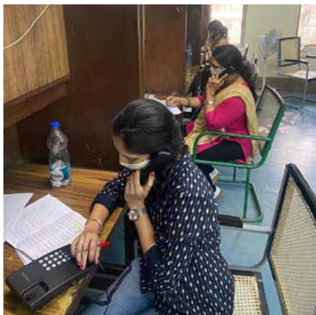
Psychosocial Support Cell Helpline Counsellors at work