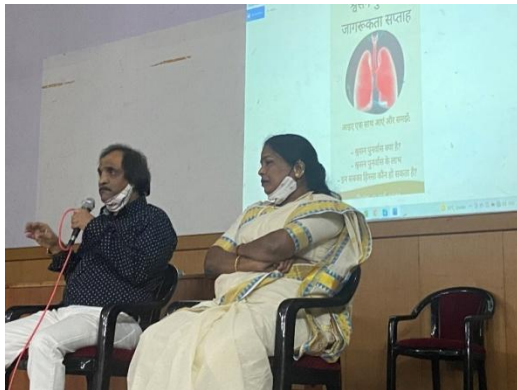
Patient narration on Pulmonary Rehabilitation Awareness week at CVTC auditorium