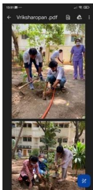
Tree plantation activity