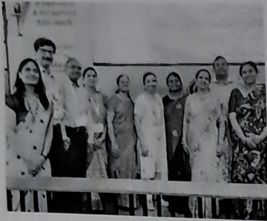
12. Awarded for Speaker and Panelist at INKCON 2024, Kolkata.